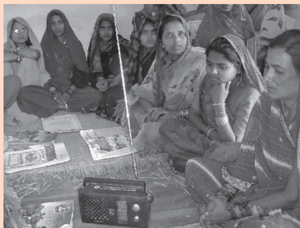
A listener group in Nepal hears an E-E radio program. Listening together creates opportunities for discussion and can generate collective behavior change. Listener groups also help program managers monitor dramas and make changes to increase effectiveness.

They may also be asked what changes they might make in their lives because of the drama (26, 28).