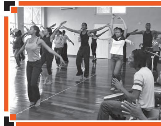
The Ashe Caribbean Performing Arts Ensemble uses dance and song to teach young people about sexuality, reproductive health, and HIV prevention. Its EIC method Excites young people with performances of music and dance, Involves them in arts training, and encourages a Commitment to making healthy choices.

Theater and street theater are performed live, usually in a central community location. Theater can quickly and powerfully draw people's attention to an important health topic such as family planning, female genital cutting, violence against women, or HIV prevention (3, 9, 24, 38, 45, 64, 117). People without access to radio or TV can watch. For example, in Bolivia, Teatro Trono enlists street children to perform plays for street children about drugs, self esteem, leadership, and gender equity (38). A street theater production can be performed