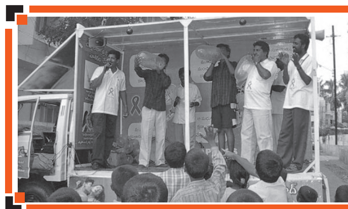
The Nriyanjali Academy presents street theater as part of an AIDS awareness program in Andhra Pradesh, India. Using a mobile van as a stage, the drama group gives condom demonstrations and performances about HIV/AIDS, STIs, and their prevention and treatment.