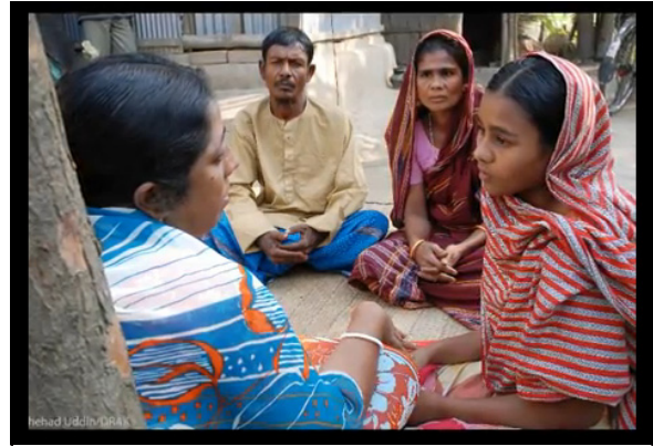
We tested our initial concepts with our target audiences: mothers, fathers, grandmothers, and community health workers.

From our formative research, we knew that mothers and other family members – even